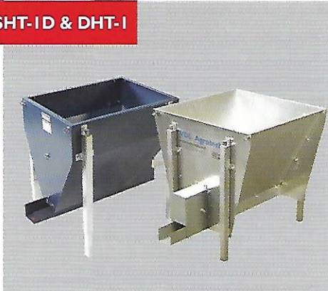
Feedhopper SHT-ID & DHT-I